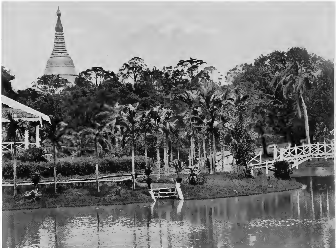
Cantonment Gardens, Rangoon, showing Shwe Dagon Pagoda